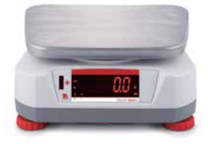
Rear Display with Integrated Touchless Sensor