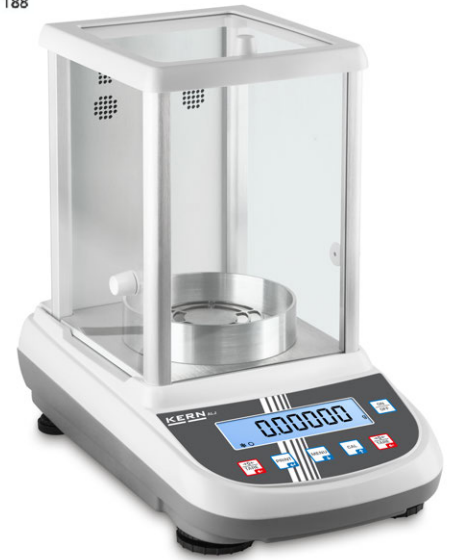
1 KERN ALJ 200-5DA with optional ionisor 2, see Accessories

Analytical balance range with large weighing capacities – now also with EC type approval [M] or available as semi-micro analytical balance