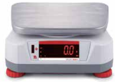
Rear Display with Integrated Touchless Sensor