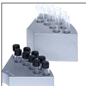
Vial and Test Tube Blocks