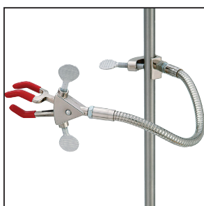
Ultra Flex Support Kit