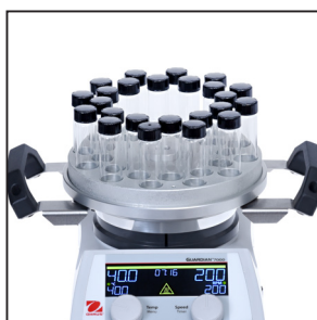
Base Plate and Handles