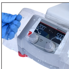
In Use Cover