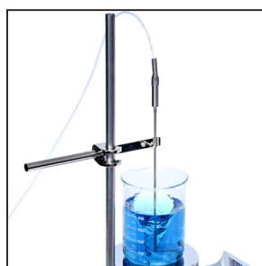
Support Rod and Clamp Kit